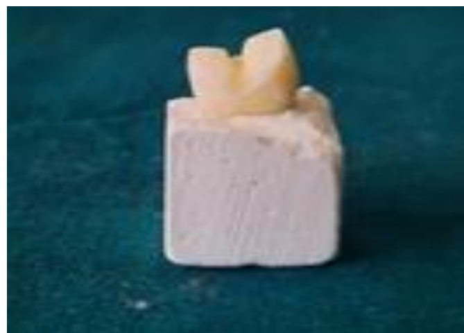
Figure 2: 2.5MM reduction of CUSP for overlay