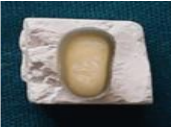
Figure 4: Final Restoration