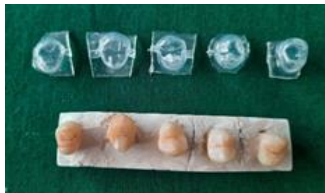
Figure 1: Occlusal stents for final restoration

Splints were prepared to simulate the exact occlusal tooth anatomy to be used later during restoration. Polyvinyl siloxane (light body) impression material was coated around the roots of the teeth 2mm below the CEJ and mounted in a cylindrical plastic mould 1 mm below the CEJ using chemically cured acrylic resin to simulate the periodontal ligament and alveolar bone. (Fig 1) Standardised through and through MOD preparations were done measuring 3mm buccolingually with gingival margin 1mm above the CEJ. Resulting root canal orifices were pre enlarged, prepared to F2 Protaper rotary files using X smart endomotor (Dentsply) and 3% NaOCl and 17% EDTA. Root canals were obturated using F2 Protaper cones (25mm, 8%) and AH Plus sealer. GP was sheared off 2mm below CEJ. (Fig 2)