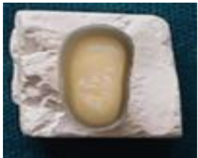
Figure 3: Crown preparation for PFM